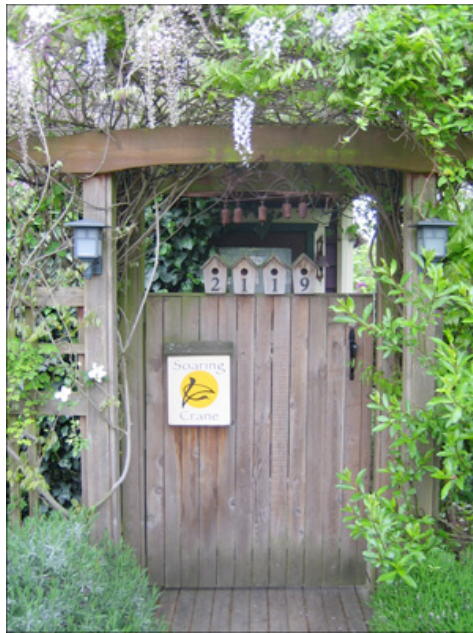
The Cedar Gate